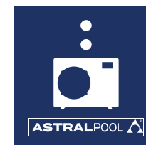
HEATPUMPGO SMART APP CONTROL

* Wifi capability included in Viron Inverter and Top Discharge Heat Pump range. Available as an optional add-on ECO models.