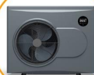
Front Airflow Design