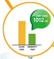
Double Your Energy Savings